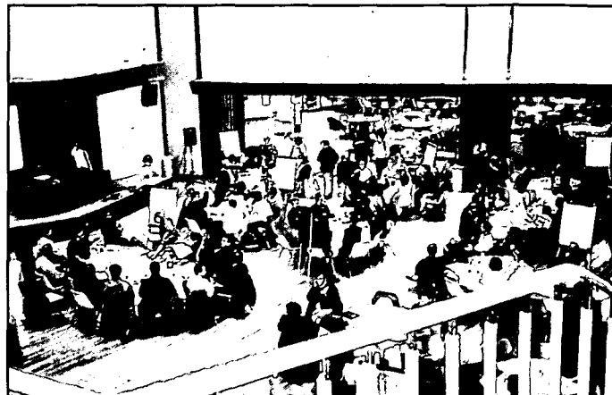
Summit participants in work groups on Saturday.